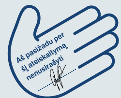
This is the pledge that was used for the experiment